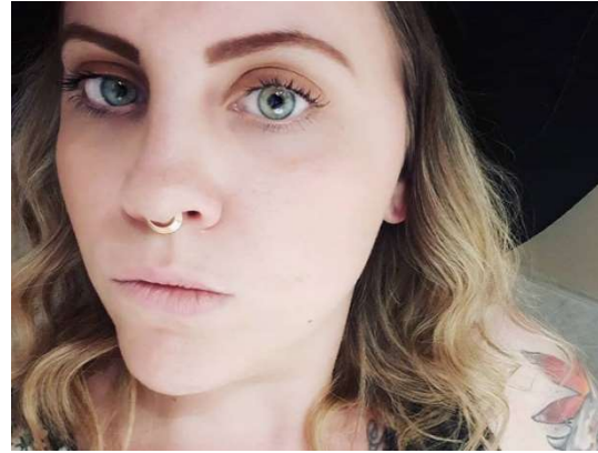
4 th year

When I look back on my time at Western, it seems daunting to count the ways I've changed. Yet, these changes have been largely positive, and I have accomplished things I never imagined I could. While in four years, I likely won't remember the different between a metaphor and a metonym, I will carry with me all that I've learned about myself, how to be an informed and engaged citizen, how to think critically and take nothing at face value, and how far hard work and determination can take you. I can't wait to see what the next four years has in store.